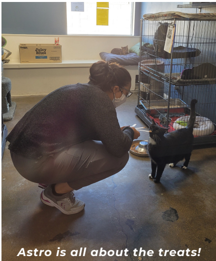
Astro is all about the treats!

The Cat Pawsitive Pro volunteers have been hard at work learning techniques and tricks to work with cats.